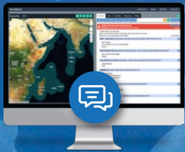
Multilingual messaging, chat, alerts (communication-oriented)