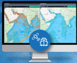
Satellite-based Data Feeds (coordination-oriented)