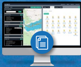
File exchange, documents and forms (coordination-oriented)