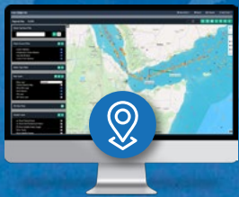
Advanced mapping + vessel intercept (coordination-oriented)