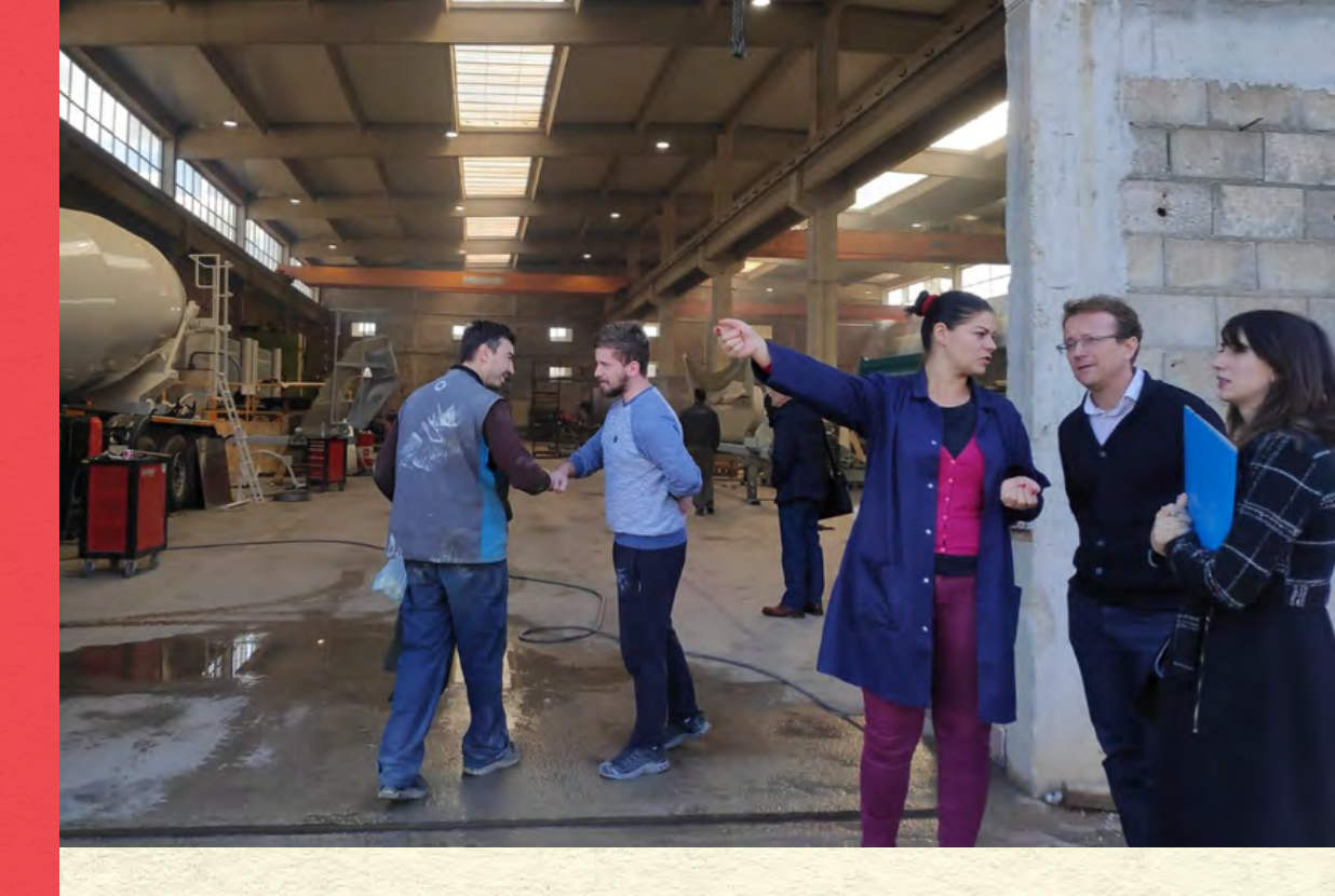
10.5. Visit to the metal processing company "Euromix Beton" in Bar

On Saturday, 30th November 2019, we visited a metal industry "Euromix Beton" in Bar for energy efficiency mapping.