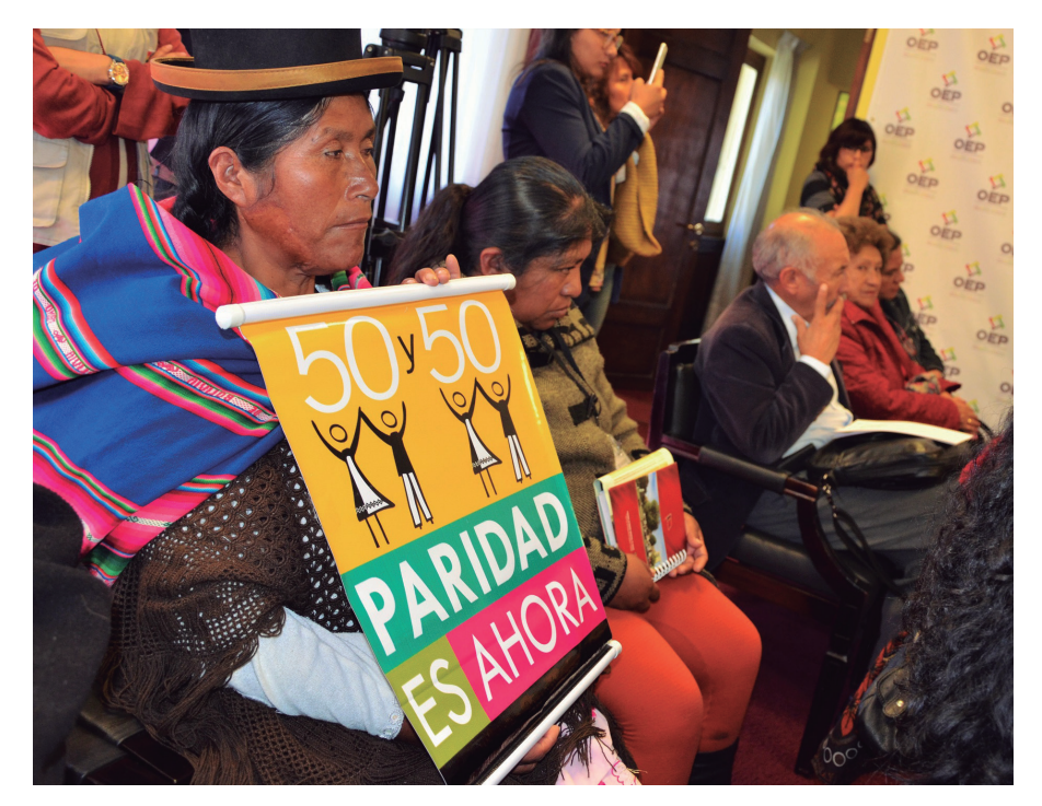
II Meeting of AMEA where it was agreed to create the Network of Observatories for Democratic Parity in Latin America and the Caribbean.

On the one hand, new forms of violence and political harassment have appeared to prevent women candidates or elected representatives from exercising their mandates. And there are great regional differences, particularly in local elections and especially in the case of indigenous and Afro-descendant women. Work has therefore been done on giving support for the effective application of parity laws promoting the exercise of the mandate for elected women in various areas (economic, social, cultural and political), and, specifically, the fight against harassment and political violence.