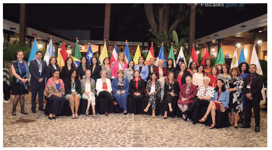
AIAMP's Specialist Network on Gender Issues attended

Fight against gender violence (particularly femicide): In the programme, we promote