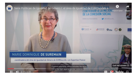
Gender Equality Policy Series I: the EUROsociAL+ Equality area