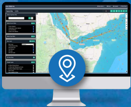
Advanced mapping + vessel intercept (coordination-oriented)