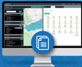
File exchange, documents and forms (coordination-oriented)