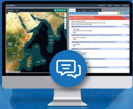
Multilingual messaging, chat, alerts (communication-oriented)