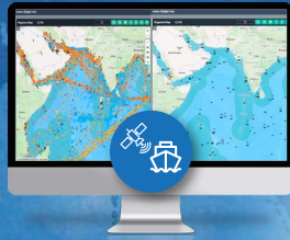
Satellite-based Data Feeds (coordination-oriented)